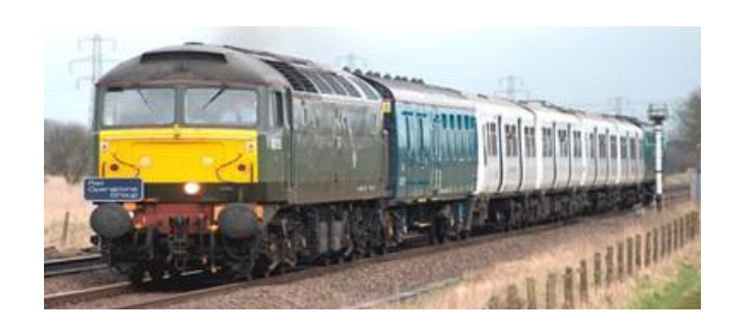
Train Operating Company Licence Holders (TOCs and FTOCs)