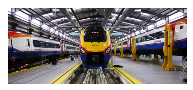
Rolling Stock Maintenance (Workshops, product suppliers and turnkey modifications installers)